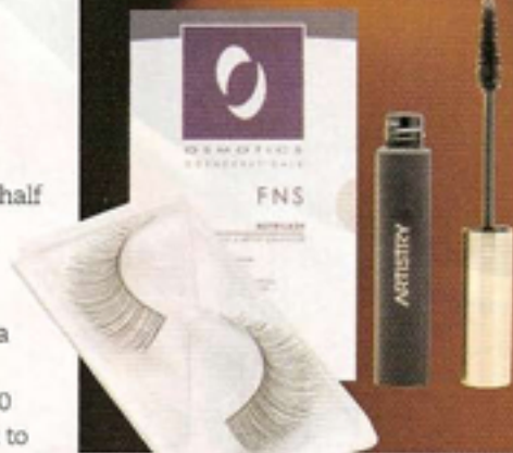
Osmotics Nutrilash, Artistry Mascara and Black Radiance Fantastic Fakes