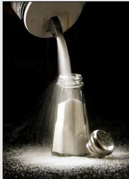
See full image