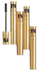
Yves Saint Laurent Everlong Mascara $28.50