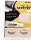
Andrea Starter Kit $4.84