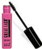
Maybelline Great Lash Waterproof $4.49