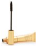
Jane Iredale Longest Lash Mascara $32