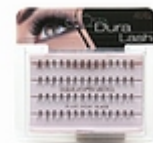
Ardell Duralash Flare $2.22