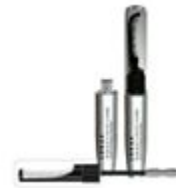
Lorac Publicity Stunt Mascara $19