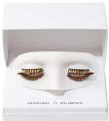
Viktor + Rolf for Shu Uemura Rhombus Couture $95