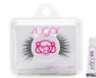
Sugar Flirt Lashes $5