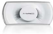
MAC 'Hello Kitty' Lashes $12